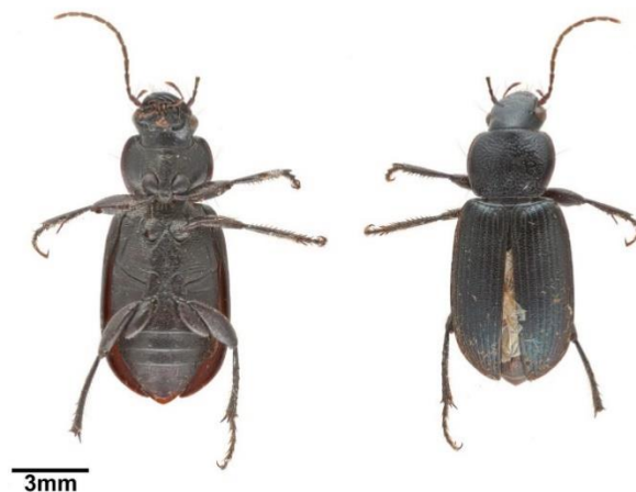
Fig.1 Anaulacus amplusculus . dorsal view and ventral view

s Anaulacu (Aephnidius) amplusculus (Fig.1)The first specimen collected by Bates in the state of Pará in Brazil in 1876 and described by Chaudoir 1876, the elytra is dilated, the body size is large, about 6-10 mm, the color of the dorsal surface of the head and the elytra is defined by one color, black, dark, dark, dull or glossy Intermittent, the lines of the elytra are elongated and a slightly reticulated pattern (Ball and Shpeley ,2002) the distance between the lines is narrow, the stalk, the edge of the elytra, the anterior thorax, the antennae and the legs, the maxillary texture is reddish to dark brown, the male genital organ is elongated with warping before the base of its end, and the basal region is slightly narrower than The middle region, the shin contains a spur in the middle and end of the leg, and the edge of the leg is smooth, not serrated, the lower jaw has a lateral edge extending to the back, and the elytra from the top contains a medial longitudinal slit from the beginning of the elytra, and it also contains four long and prominent lateral hairs tilted towards red, and the bases of the hind legs contain bulges on both sides (Ball and Shpeley ,2002), (Assmann et al , 2015).